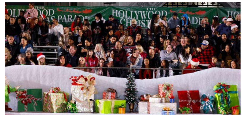
Hollywood Christmas Parade: Page 8