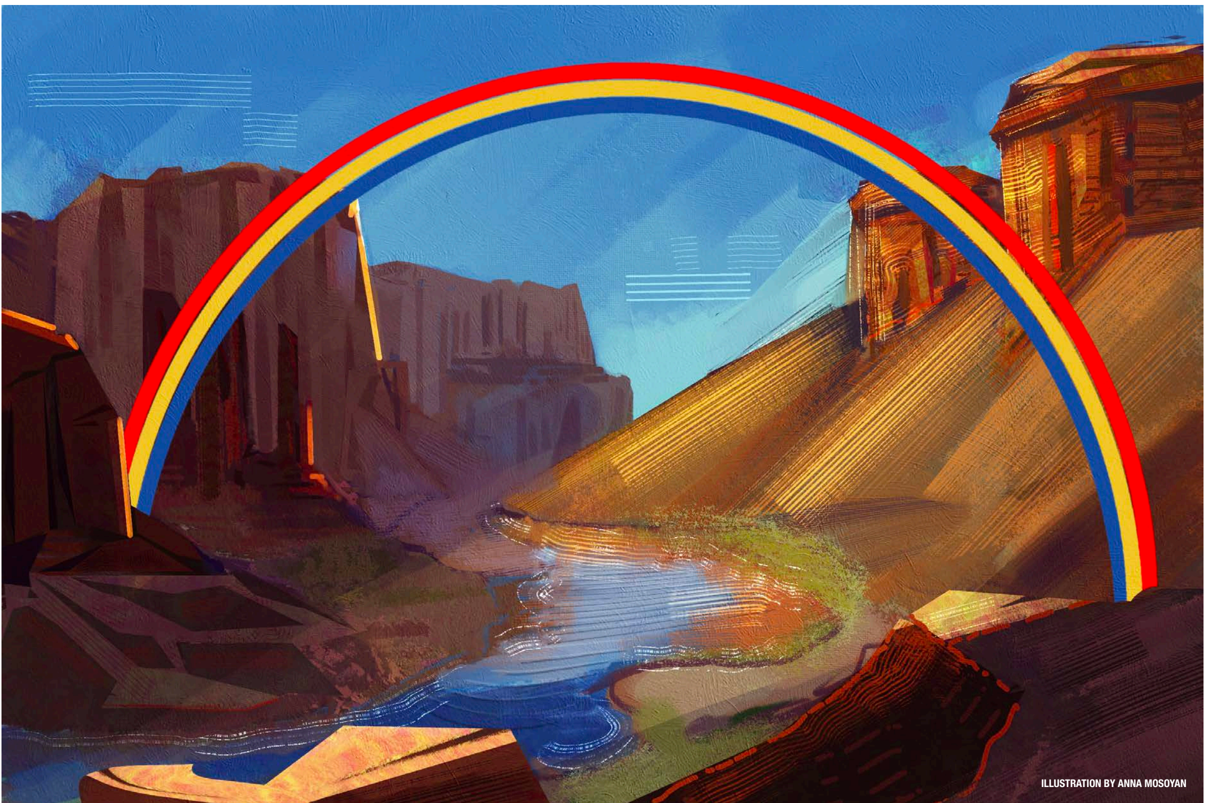
ILLUSTRATION BY ANNA MOSOYAN