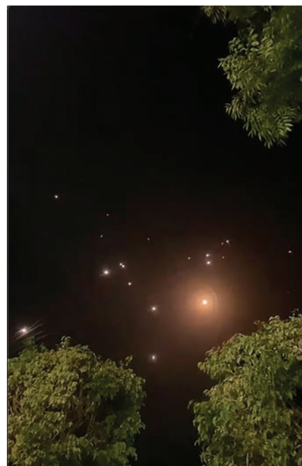
Incoming missiles light the night skies over Israel in late October near Gaza.

13 October 2023 - Russian President Vladimir Putin warns of escalating tensions after the U.S. sends its carrier strike group into the Mediterranean to assist in supporting Israel.