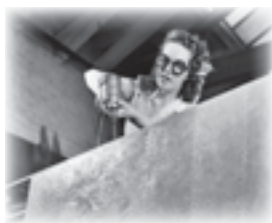
During WWII, thousands of "Rosie the Riveters" enrolled at Trade Tech, lending their skills to support the war effort.

The advent of World War II created an exponential demand for the college's training programs in support of the war effort. The college's Aircraft and Welding Trades departments operated directly under the supervision of the federal War Production Training Program, while the majority of other programs were quickly reformatted to provide short-term training of six to ten weeks' duration, often at war production plants located throughout the city.